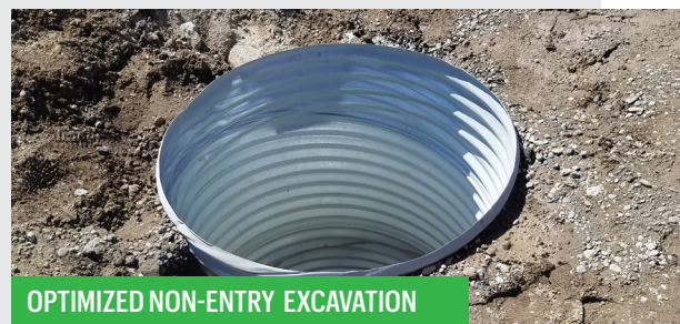
OPTIMIZED NON-ENTRY EXCAVATION